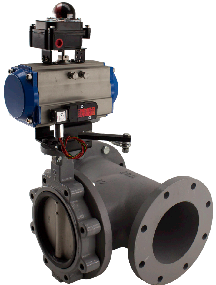
2 Position Configuration Shown with optional limit switch

Air is supplied to Port B forcing the pistons toward each other (towards center), rotating the drive pinion clockwise and exhausting air out of Port A