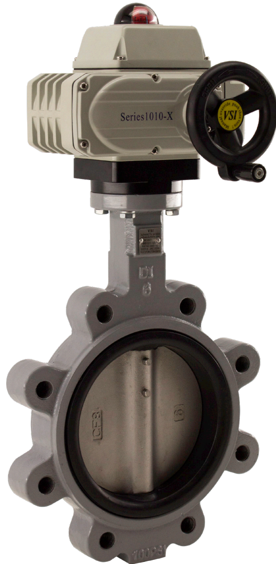
Shown with optional handwheel