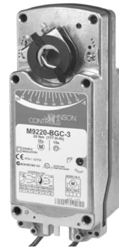
M9220-xxx-3 Electric Spring Return Actuator

The M9220-xxx-3 Electric Spring Return Actuators provide reliable control of dampers and valves in Heating, Ventilating, and Air Conditioning (HVAC) systems. The M9220-xxx-3 Actuators are available for use with on/off, floating, and proportional controllers.